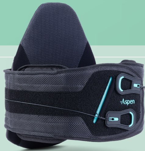
HORIZON PRO 637 LSO CODE L0637/L0650 APPROVED

Backed by clinical research and 10 years of trusted technology, the Horizon PRO provides an updated approach to pain management. Its inelastic design combined with targeted compression offers immediate relief from symptoms caused by injury, muscle fatigue, and spasms.