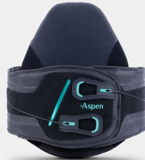
HORIZON PRO 631 CODE L0631/L0648 APPROVED