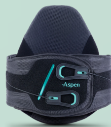
HORIZON PRO 631 LSO CODE L0631/L0648 APPROVED