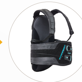
Horizon PRO 456