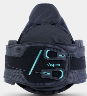
HORIZON PRO 639 LSO CODE L0639/L0651 APPROVED