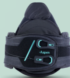
HORIZON PRO 639 LSO CODE L0639/L0651 APPROVED