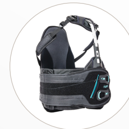
NEW! Horizon PRO 464

Introducing the Horizon PRO 464/456 TLSO, a low-profile, modular solution that follows patients through the continuum of care. By offering a two-in-one solution that easily combines a 464 and 456 brace, clinicians can offer the best option for patient needs without carrying excess inventory.