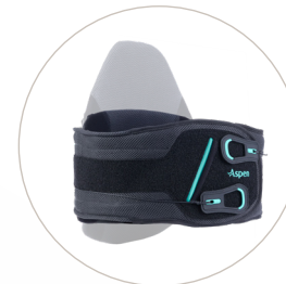
Horizon PRO 456