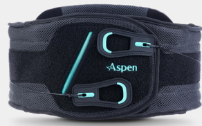
HORIZON PRO 627 LUMBAR CODE L0627/L0642 APPROVED