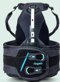
HORIZON PRO 464 TLSO CODE L0464/L0457/L0456 APPROVED