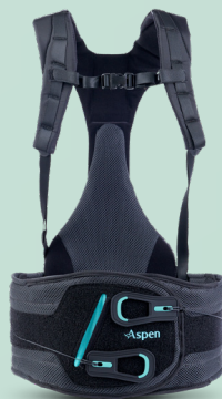
HORIZON PRO 456 TLSO CODE L0456/L0457 APPROVED