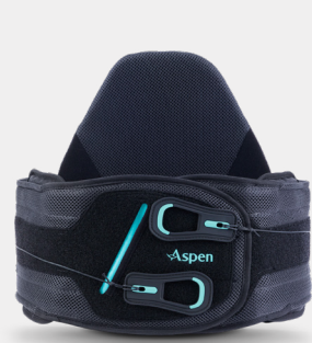
HORIZON PRO 637 LSO CODE L0637/L0650 APPROVED

Manage symptoms of low back pain and add trunk stability with market-leading technology.