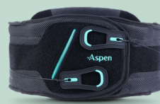
HORIZON PRO 627 LUMBAR CODE L0627/L0642 APPROVED