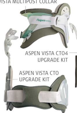
ASPEN VISTA MULTIPOST COLLAR

If additional motion restriction is required, both the Aspen Vista CTO and Aspen Vista CTO4 Upgrade Kits attach easily to the Aspen Vista MultiPost Collar.