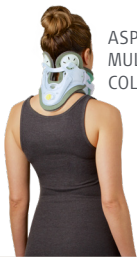
ASPEN VISTA MULTIPOST COLLAR