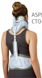
ASPEN VISTA CTO4

Flexible Thoracic Adjustment Ⓐ One size fits essentially all patient anatomies and unlocks to adjust during original fit and repositioning.