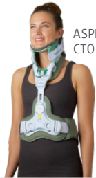
ASPEN VISTA CTO