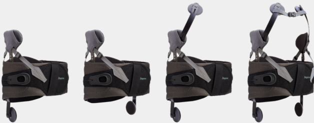
MULTIPLE OPTIONS FROM ONE BRACE

Multiple configuration options give providers the ability to customize a patient's treatment. With this modular design, providers are able to assemble the right brace for each patient.