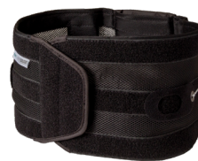
ASPEN QUIKDRAW™ PRO