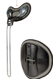
RIGID ANTERIOR PANEL (RAP)